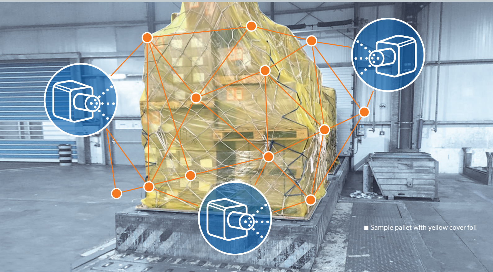
■ Sample pallet with yellow cover foil